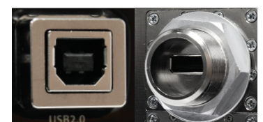
Solid milled USB connector protection!