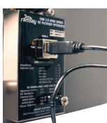
Solid milled Strain Relief!

Next we added integral solid milled connector tension surrounds on all sides and a threaded cable strain relief post to eliminate stress damage to the USB connector. We even provide a strain relief cable clamp!